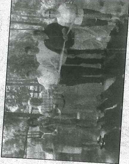
Officials from Putnam and several local organizations including The Last Green Valley and the Hale Youth Family YMCA, help cut the ribbon for the extension of the Quinebaug River Trail on Kennedy Drive on July 6.