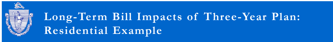
Figure 1. Commissioner Woolf, Slide 11 from “Bill Impacts of Energy Efficiency Programs” presentation to Law Seminars International, September 27, 2010