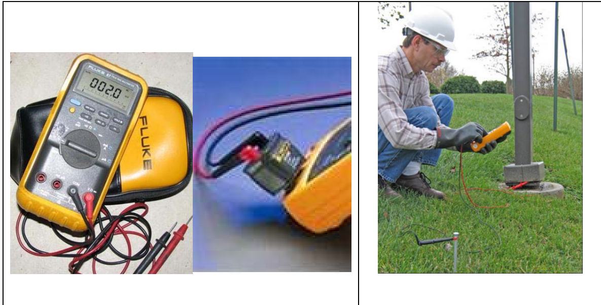
1 Figure 2: Fluke Multi-meter and Resistor and its use. Fluke Corporation and EPRI.

2 3 If an elevated voltage is verified greater than 4.5 volts and less than 8 volts, it will either 4 be guarded in person or guarded by the installation of a protective barrier that prevents 5 public contact. If the voltage measurement is greater than 8 volts, it is guarded by 6 elevated voltage inspector or Company employee who has been trained to stand by on 7 energized facilities until immediate steps can be taken to mitigate the voltage level. 5