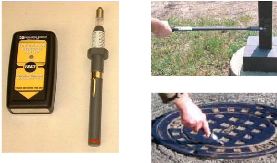
4 Figure 1: Handheld voltage probe and its use. HD Electric Company.

1 example of which is shown below in Figure 1, and (2) verify voltage measurements using 2 a digital multi-meter which has the ability to take readings using a 500 Ohms shunt 3 resistor, as shown in Figure 2. 4