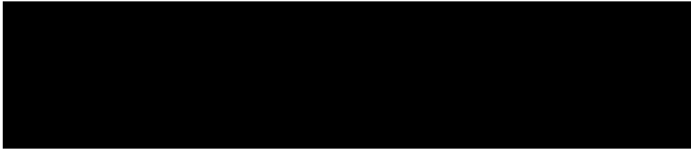
Exhibit 5 is a list of the winning bids by REC type and year. National Grid expects to purchase a total of [REDACTED] RECs at a cost of [REDACTED]. The following is a summary of the RECs procured in this RFP.